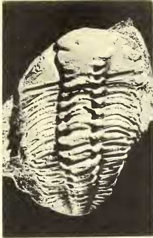
4 x 2.5